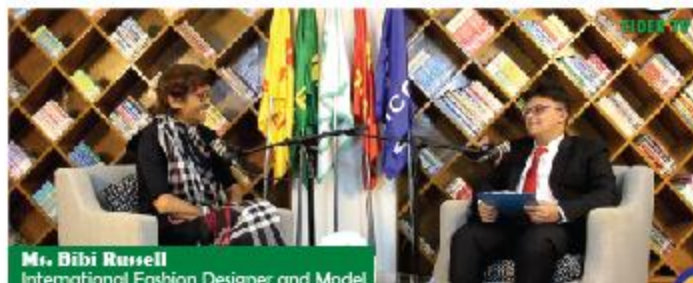
Mr. Bibi Russell International Fashion Designer and Model