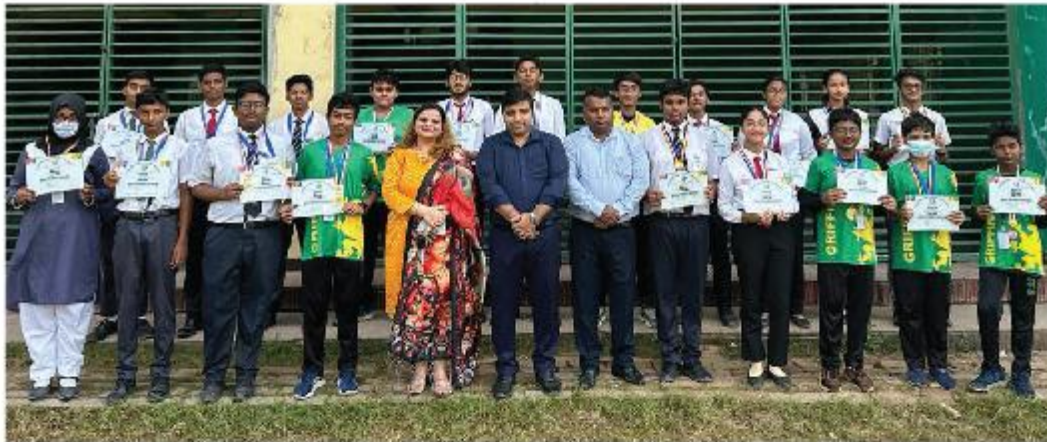
Final Result of 6th Intra School Math Olympiad 2023-2024