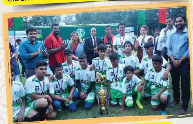
Inter School Futsal Football Tournament 2023