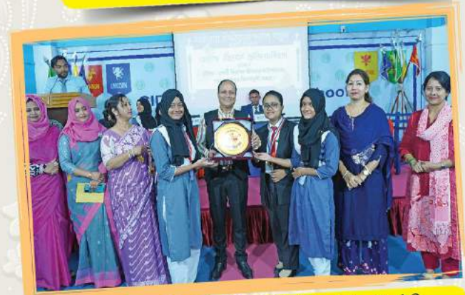
বাংলা বিতর্ক প্রতিযোগিতা ২০২৩ - ২০২৪