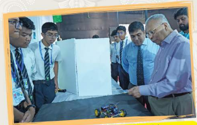
Science & IT Fest 2023-24