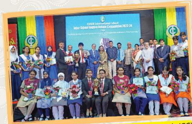
CIDER International School's Debating Triumph (CC)