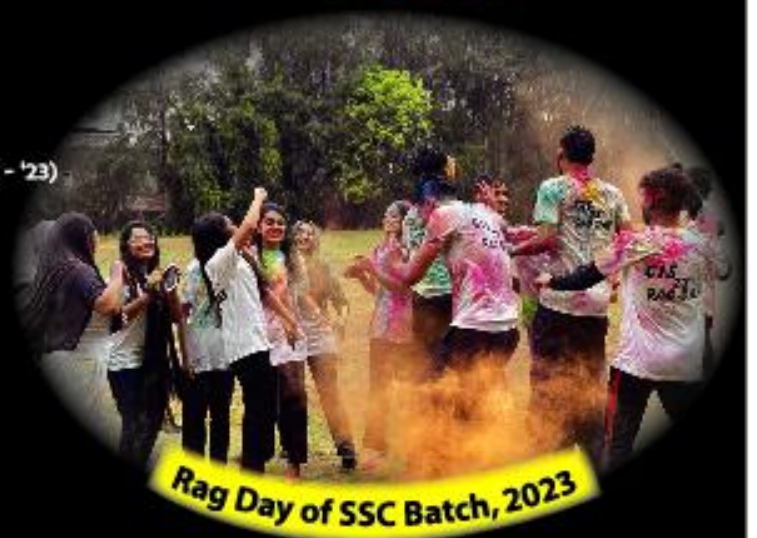
Rag Day of SSC Batch, 2023