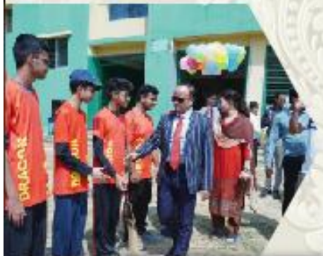
Inter-House Cricket Tournament