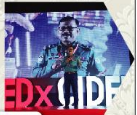
CIDER TEDx TALK