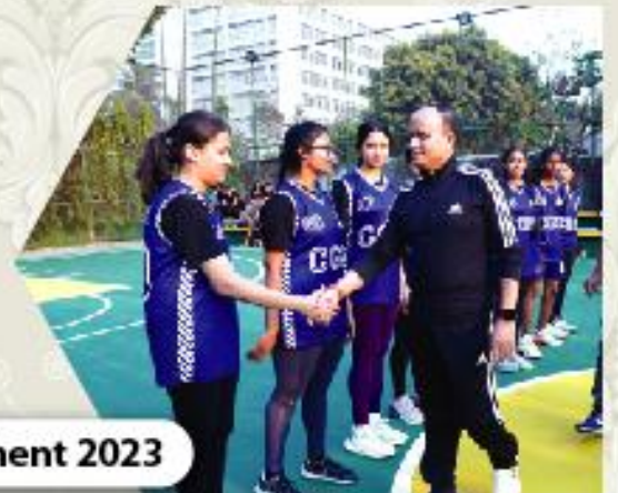
Inter School Basketball Tournament 2023