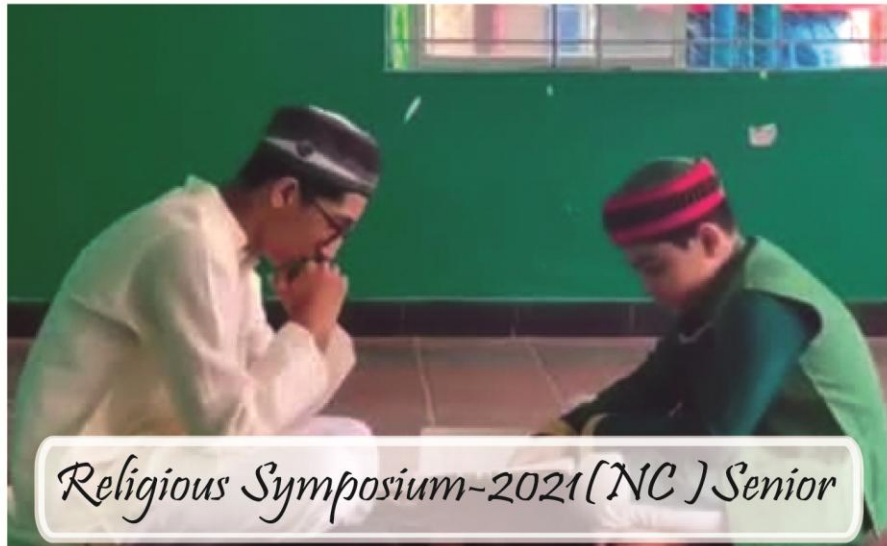
Religious Symposium-2021(NC) Senior

Teacher & HOD of Cultural Committee (NCS).