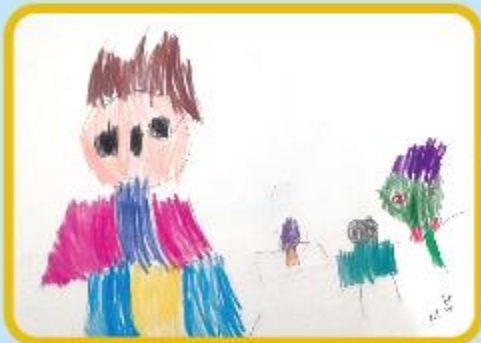
Nabian Bin Rehan Nursery A (CC)