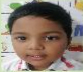
Syed Abid Safwan Play Group