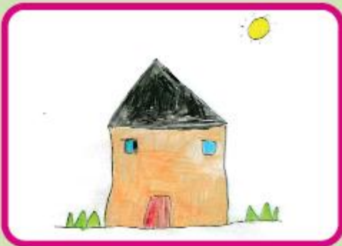
Uchingma Marma Play Group (NC)