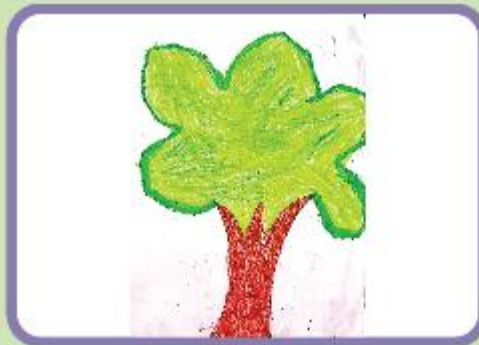
Umair Asfar Ayham Nursery (NC)