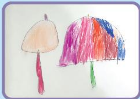
Nusaifa Mahjabin Play Group (CC)