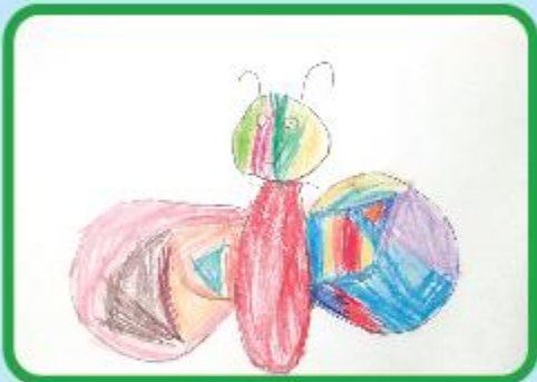
Arnisha Saha Nursery B (CC)