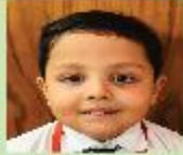
Debabrata Debnath Nursery