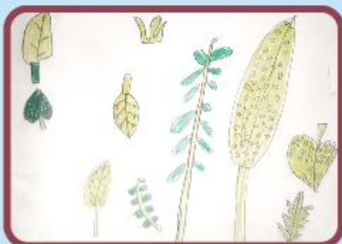
Zahra Shreez Chowdhury KGA (CC)